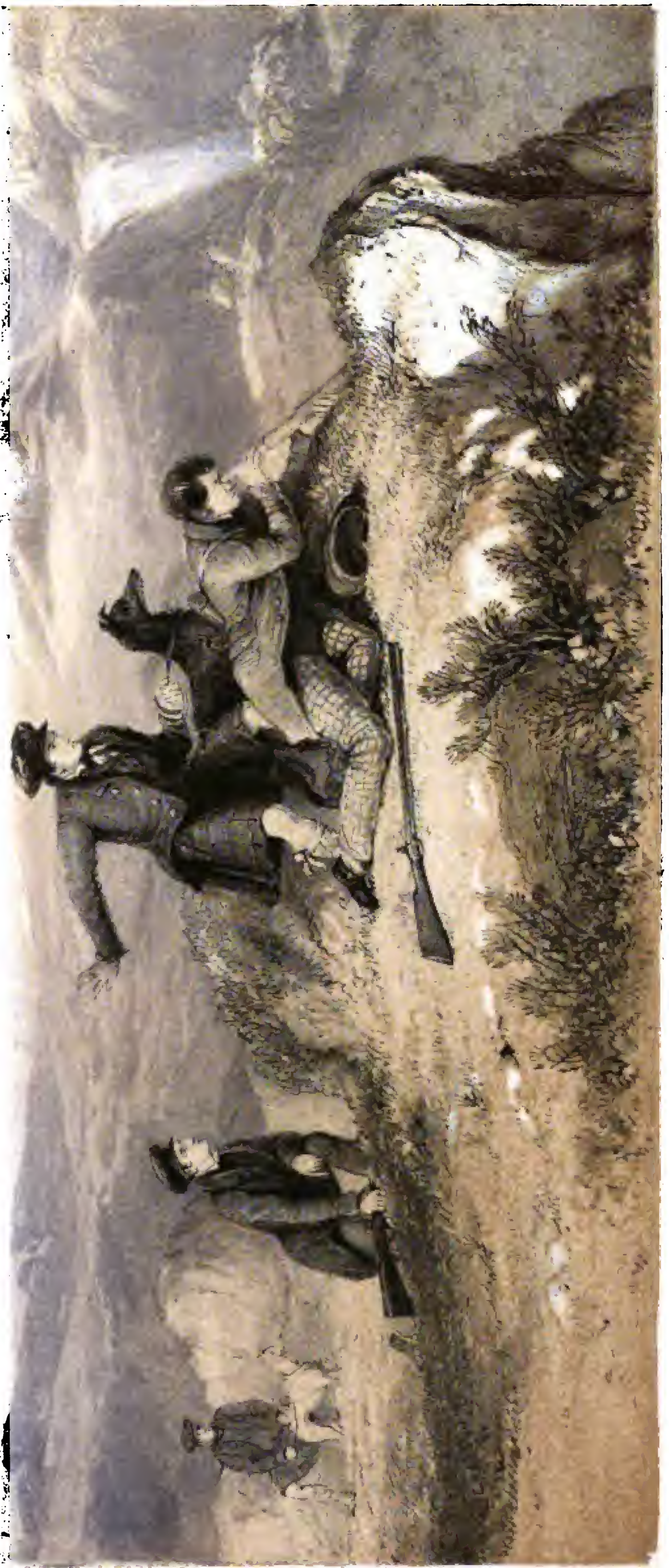
Country House, Mount St. Helens